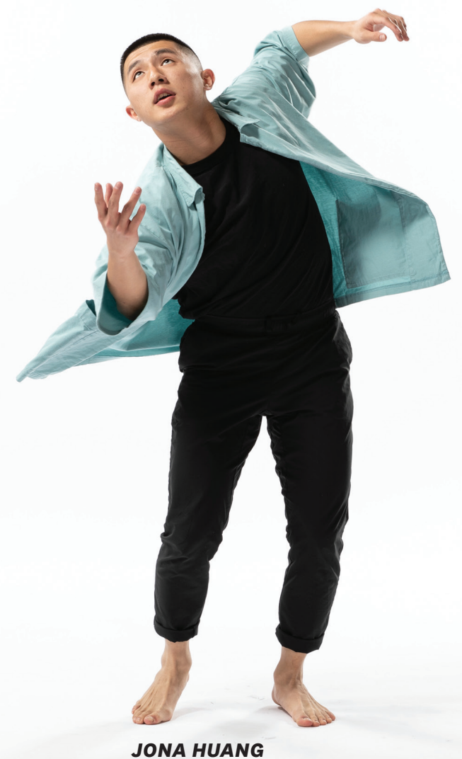
CLASS OF 2022