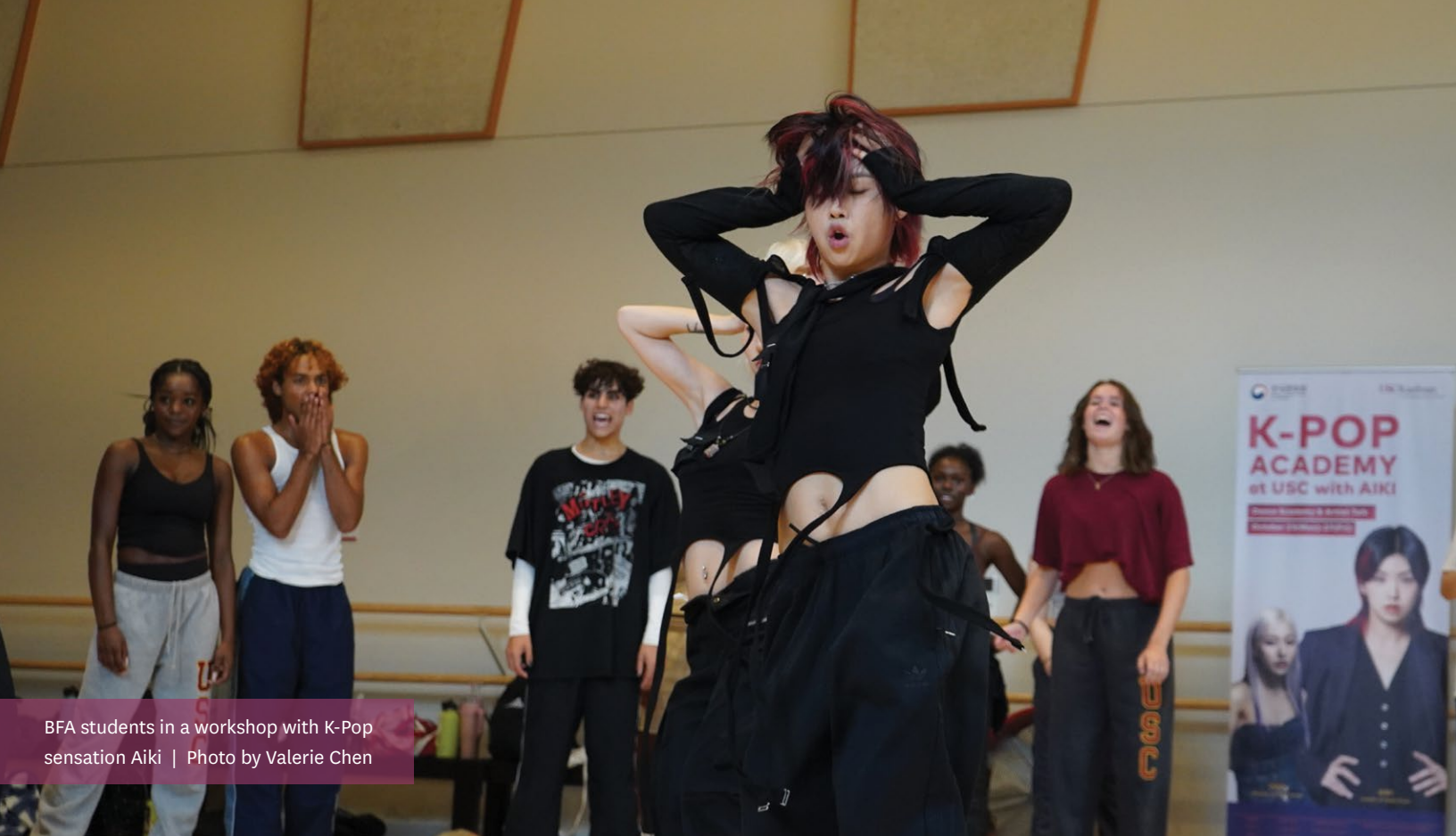
BFA students in a workshop with K-Pop sensation Aiki