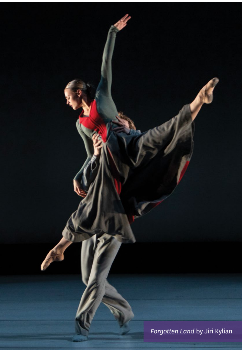
Forgotten Land by Jiri Kylian