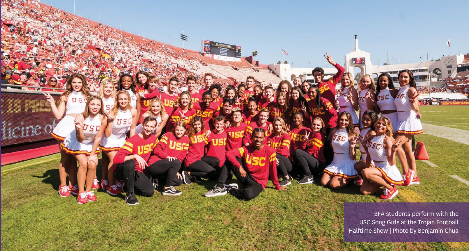
BFA students perform with the USC Song Girls at the Trojan Football Halftime Show