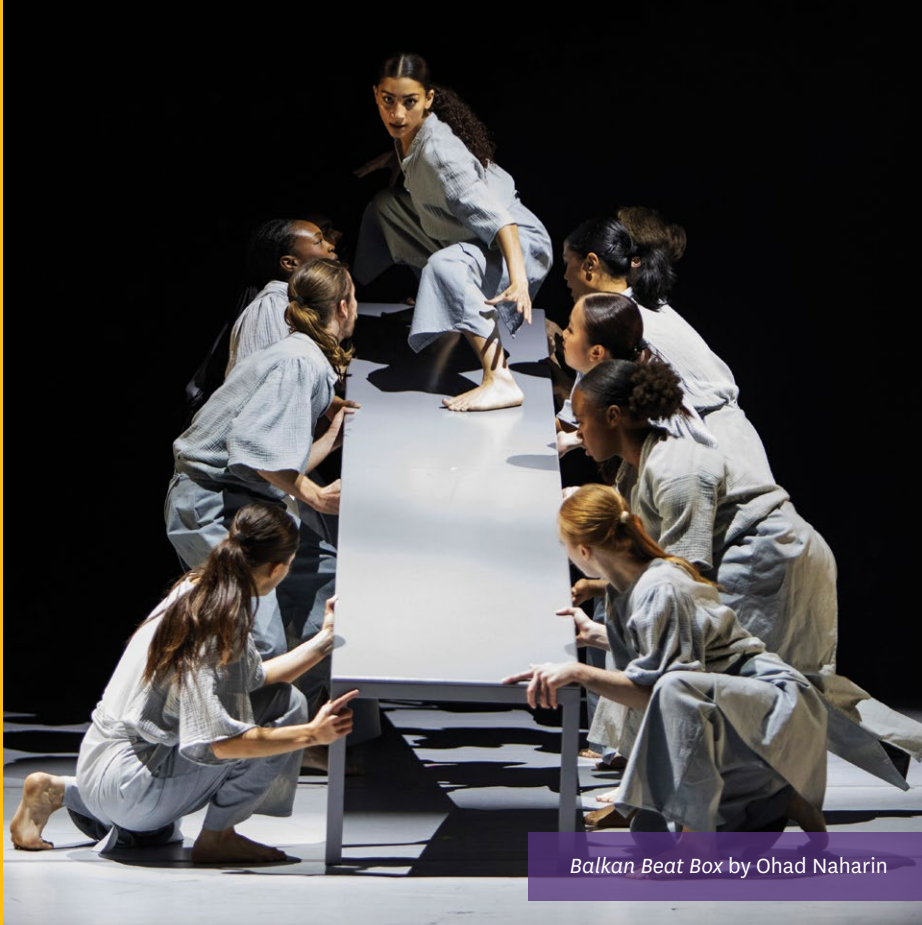
Balkan Beat Box by Ohad Naharin