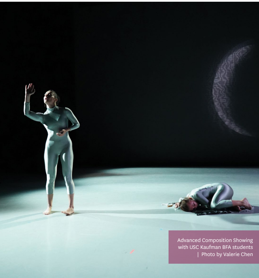
Advanced Composition Showing with USC Kaufman BFA students