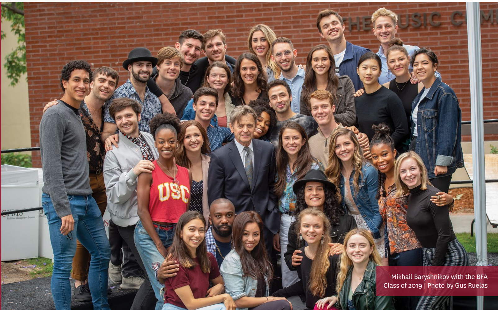
Mikhail Baryshnikov with the BFA Class of 2019