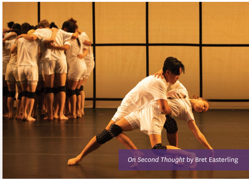
On Second Thought by Bret Easterling