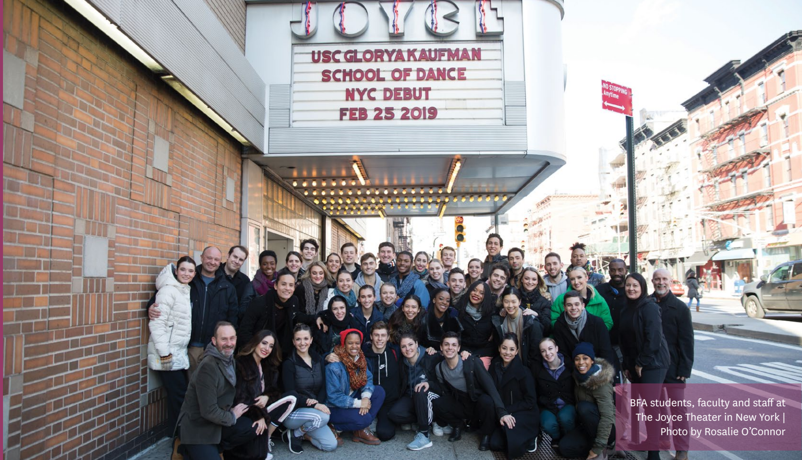
BFA students, faculty and staff at The Joyce Theater in New York